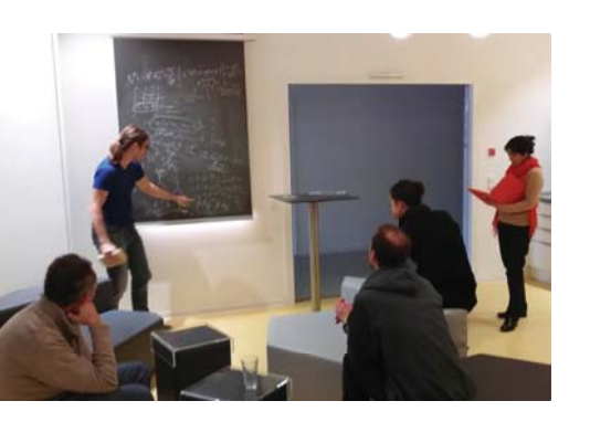
Scientific discussions during a workshop at the MITP